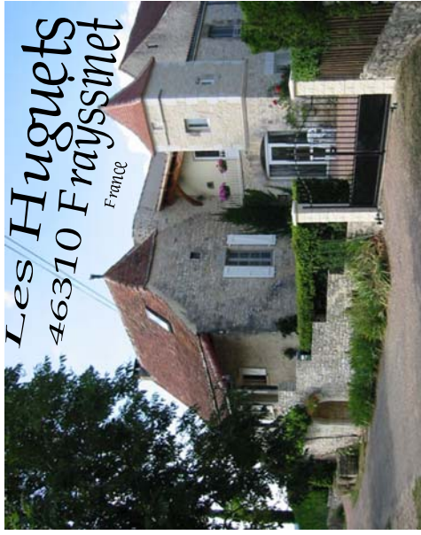
Les Huguetts 46310 Frayssinet France

The Gîte consists a Chalet, Apartment & Studio which are let as a single unit in part or as a whole.