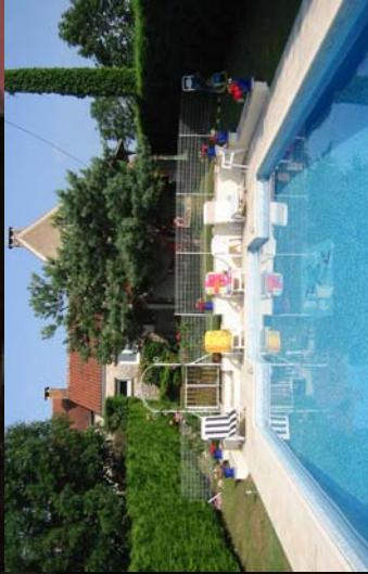
La piscine (10m x 5m, 2m deep end)

is tiled with Roman Steps & can be fully enclosed. It has the sun all day long & is peaceful, private & secluded. There are shady areas in the garden and extensive views of the forests and valleys of the Bouriane to the South West.